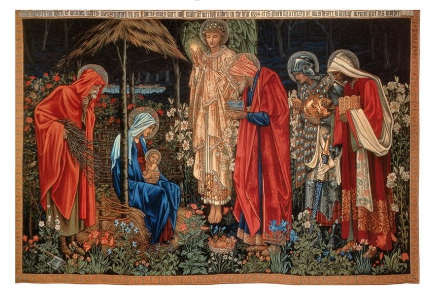
The Adoration of the Magi tapestry dating from 1894 from the Manchester Metropolitan University, England.

In New Orleans, Twelfth Night begins another season of celebrations that comes to fulfillment at Mardi Gras (Fat Tuesday, the day before Ash Wednesday). Epiphany itself, Jan. 6, becomes the kickoff day for that season, but is also often observed with a full celebration in church, complete with incense, elaborate processionals, choral celebrations, and Eucharist.